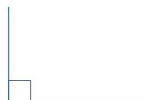
Right angle Exactly 90^\circ