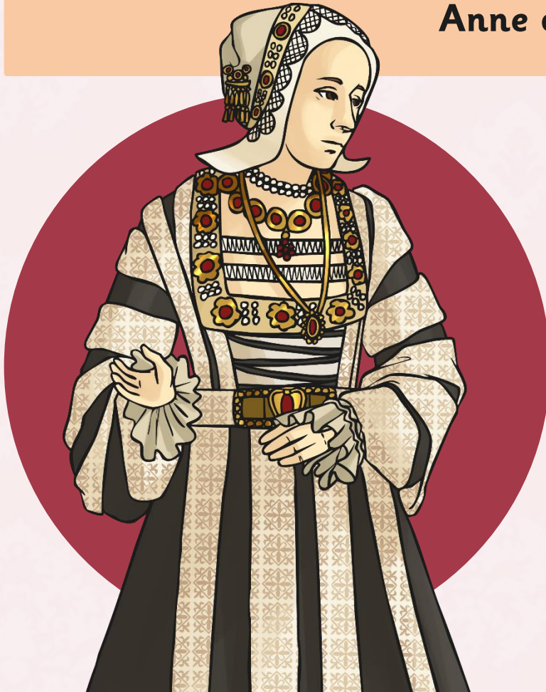
Anne of Cleves