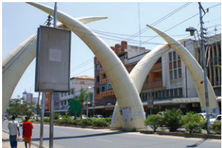
Mombasa is Kenya's oldest city and Kenya's main port.