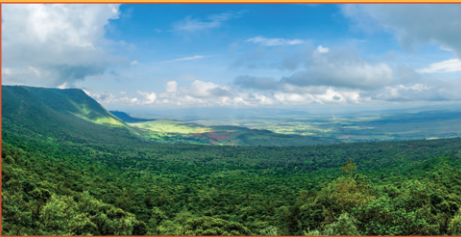
Great Rift Valley