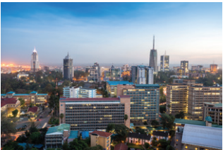
The capital city is called Nairobi.