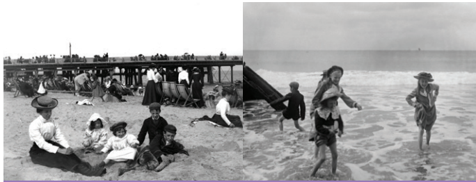
Playing in the Sand and Sea

A 'feature' is a thing that makes a place special. There are lots of features that make the seaside a special place.