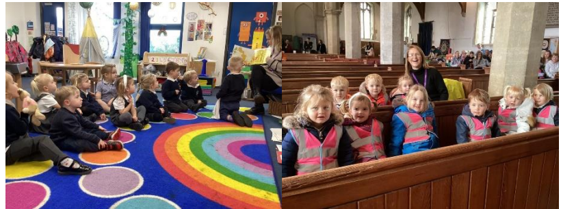
After Half Term

In Phonics, our focus will be instrumental sounds. We will also take part in lots of activities to promote name recognition. We will continue sharing lots of books, whilst encouraging oracy. In Maths, we will look at subitising, counting and numerals.